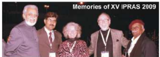
Memories of XV IPRAS 2009